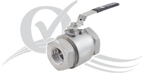
The Series HBEV valve is seal welded and non-repairable.